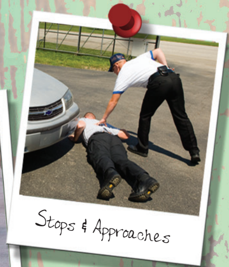
Stops & Approaches