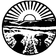
OFFICIAL OHIO SEAL

MOTTO: "With God, All Things Are Possible"