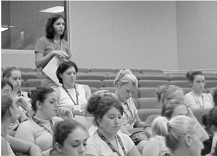
Left: House of Representatives Debating Bill