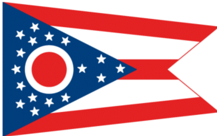
OFFICIAL OHIO FLAG